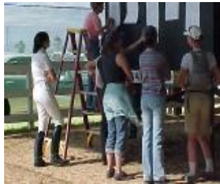
Score posting area was a popular spot on the grounds.

Every where we went, we were thanked by show management. There will be a repeat in 2006 and I can't wait to go! I hope that we can send more volunteers this year because it will earn even more money for our club and it's just too good a time to miss. I just can't say enough good about these friendly, organized and talented ladies in Houston!