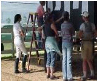
Score posting area was a popular spot on the grounds.

Every where we went, we were thanked by show management. There will be a repeat in 2006 and I can't wait to go! I hope that we can send more volunteers this year because it will earn even more money for our club and it's just too good a time to miss. I just can't say enough good about these friendly, organized and talented ladies in Houston!