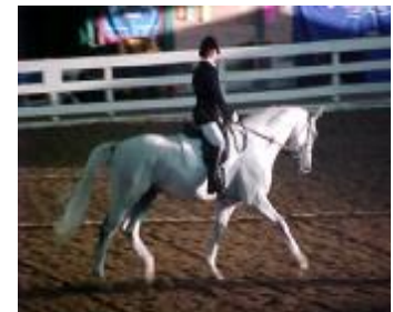
One of the many riders who competed at the Reg 9 Championships at Katy, Texas in November